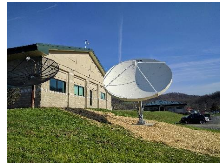
Satellite dish and feed

HARDWARE OVERVIEW: DirectMet®2 includes a visualization workstation, an ingest server, and a production platform. The DirectMet®2 processing system acquires GOES data in NetCDF4 format via the GRB direct readout satellite ground station. A complete, turnkey DirectMet®2 system includes GOES GRB ground system hardware. The GRB Satellite Receiver and Antenna System includes a 3.8 to 4.5-meter antenna (dependent on location); ground or roof mounting options; manual or motorized dish adjustment; integrated feed/down-converter; 300-foot RG-58/U coaxial cable with connectors; and a GOES GRB demodulator (rack mountable).